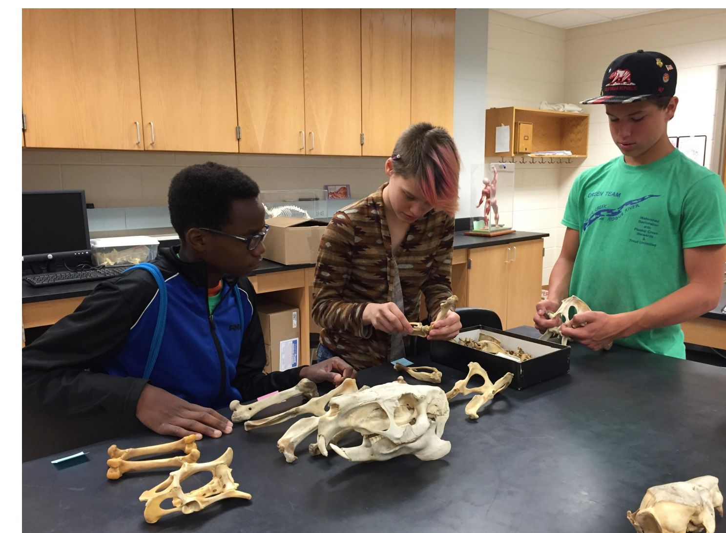
Green Team students shadowing evolution of whale bones research project with Calvin College research student.

One morning of each session the Green Team students shadowed Calvin research students in a wide variety of exciting projects.